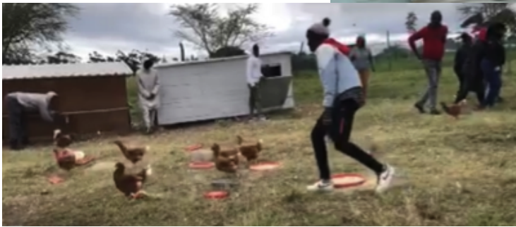
Moving the chicken tractor