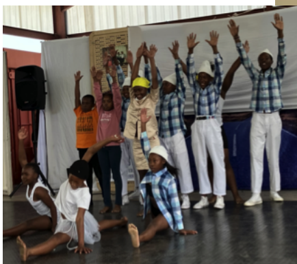
The kids love the action after their studies are over