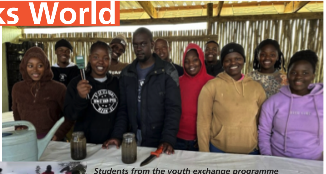
Students from the youth exchange programme conducting soil tests

Kidlinks assists and provides funding for an exchange programme between our projects in Alex and the Kidlinks Small Farm Incubator (KSFI) in the Eastern Cape. This supports our joint regenerative agriculture and food security initiatives. Working with Gumboots youth, KSFI offers them a respite from life in Alex by enabling them to experience life on a working farm.