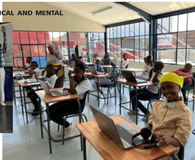
Four bright, spacious classes are conducive to learning

The children arrive at Sakhimfundo at 3pm at the end of their school day where a hot, wholesome meal awaits them ... you cannot study on an empty tummy! Classes commence in the new Learning Centre with online lessons supervised by 11 tutors, and it transforms into a quiet space, enabling them to supplement and uplift their academic performance. Once lessons are over, the centre again becomes a