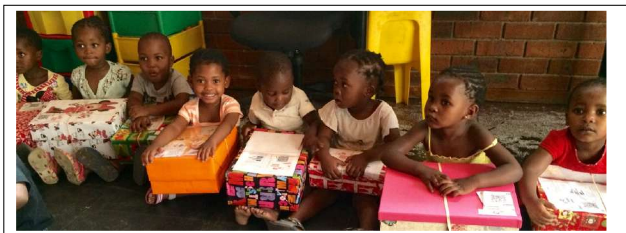
Christmas gift time at Leratong

Nevertheless every one of the projects we support reopened its doors and gave the best service possible under circumstances where more people were even more in need, whilst at the same time donations and resources were in even shorter supply. Given the high incidence of HIV/AIDS in the population many people have to be extra careful when mixing with others so some of the interaction, so important especially to children, had to be carefully handled. But, as the following photos show, our resilient and energetic project teams still managed to offer so much of value to a population in crisis and deserve our huge respect, appreciation and continued support.