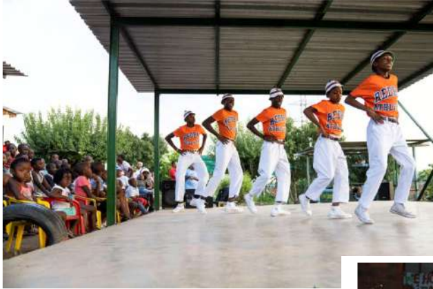
Showtime for Sigiya Sonke!