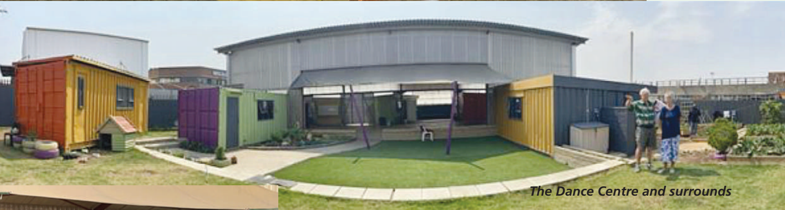
The Dance Centre and surrounds