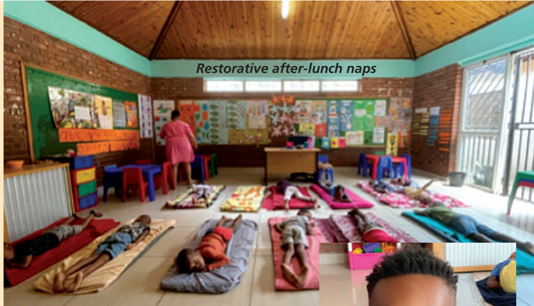
Restorative after-lunch naps

She spoke of the challenges in the broader education system where the government has recently opened the Alex schools to Grade 0 and 00 pupils. This means that the parents who struggle financially are choosing to send their kids to those (free) schools, instead of the more nurturing environment of Leratong, which provides two meals a day and an aftercare system. Consequently the kids are now roaming the streets in the afternoons and there are many reports of them being hit by cars and involved in misdemeanors.