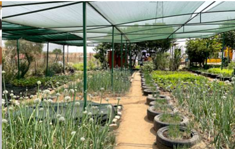
Pap and chicken feet are one of the staple diets along with daily homegrown produce