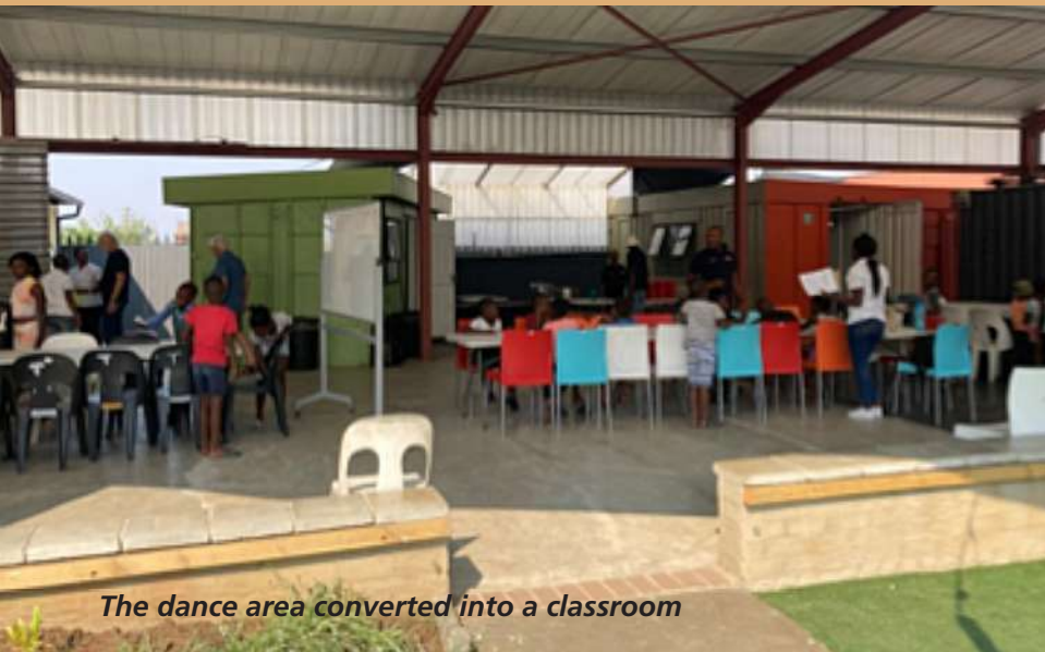
The dance area converted into a classroom