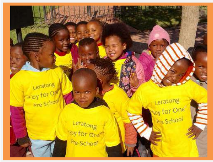
Leratong children's outing to Youth Day in Soweto

night time temperatures of a Johannesburg winter. Even those with an electric supply suffer from regular power cuts but shack dwellers more often rely on primus stoves and candles for heat and light. Naked flames mean that fire breaks out with ease and spreads quickly amongst the closely packed shacks. Two such fires this year each burnt down 30 shacks leaving hundreds homeless. Leratong housed and fed 20 mothers and children until the authorities provided a solution. In addition heavy rains bring floods with subsequent loss of homes, belongings and sometimes lives. In order to deal with such inevitable annual crises, Peggy would like to set up a Disaster Management Centre stocked with blankets, tinned food and clothes, in order to provide immediate support.