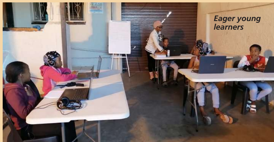
Eager young learners