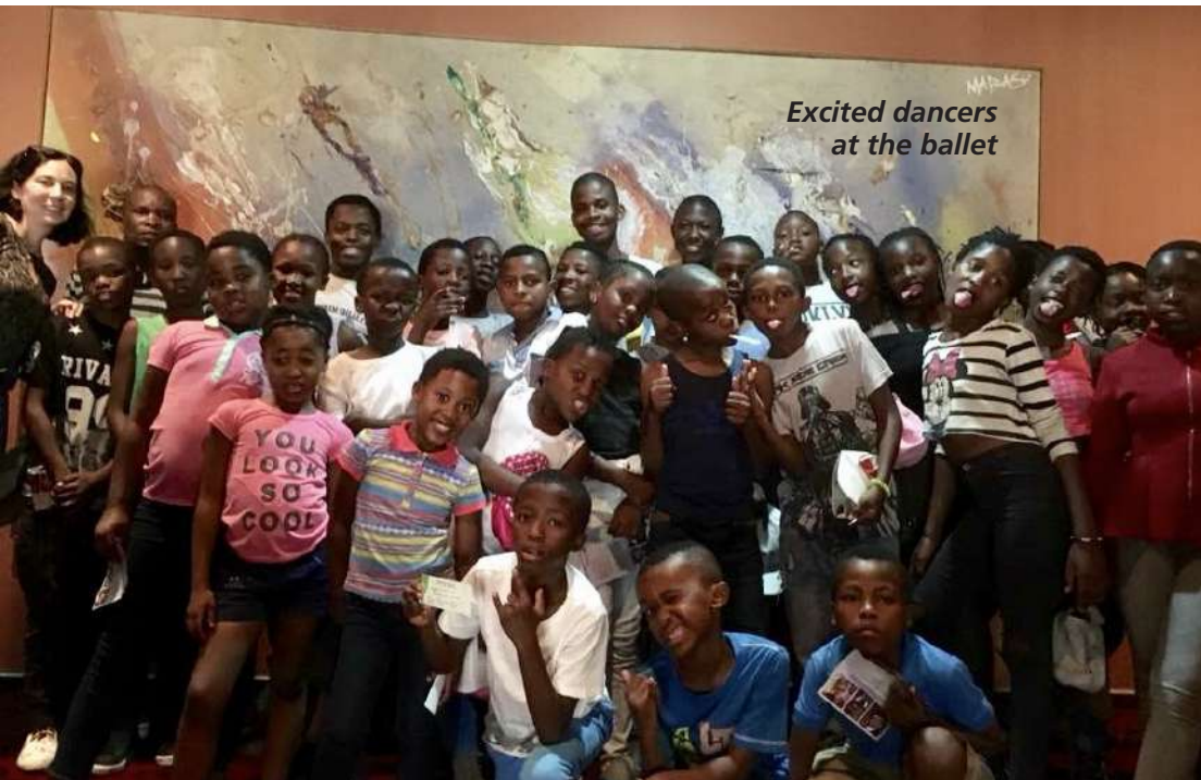
Excited dancers at the ballet