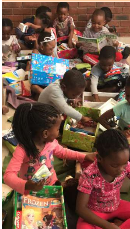
Joy, excitement and elation!