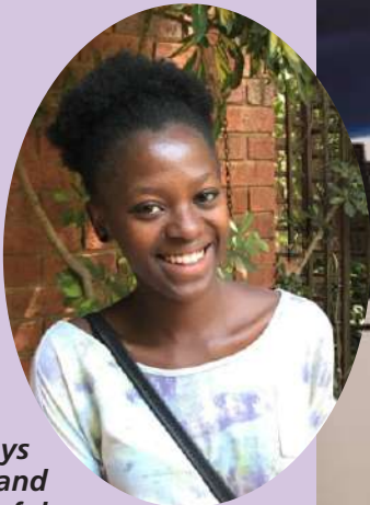
Always cheerful and grateful