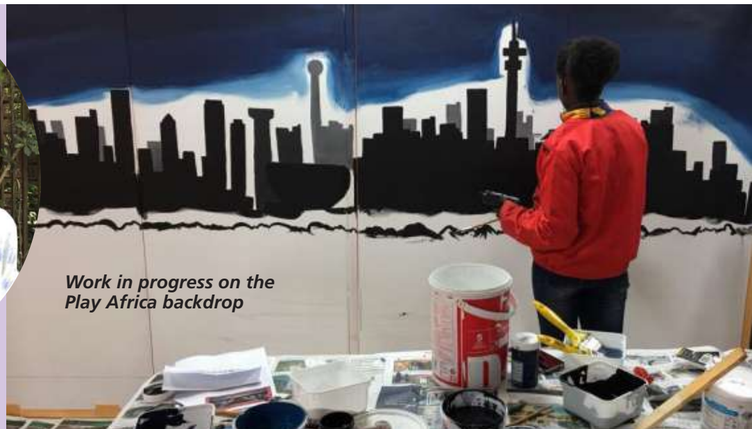
Work in progress on the Play Africa backdrop