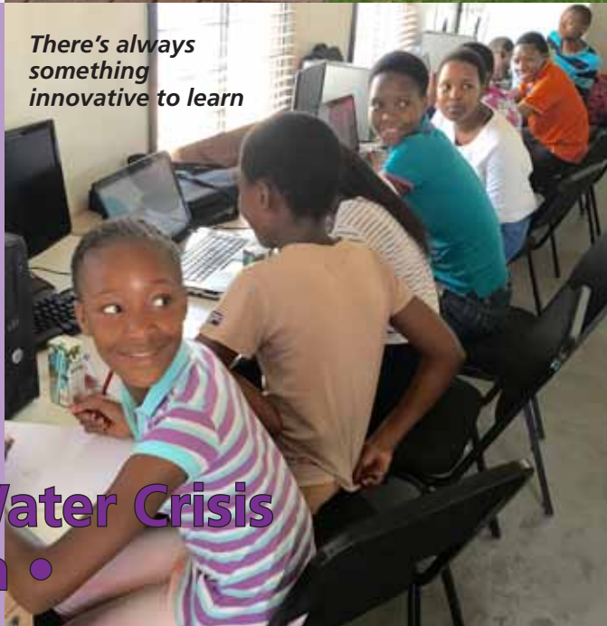
There's always something innovative to learn

Thank you from Gumboots to all the volunteers involved.