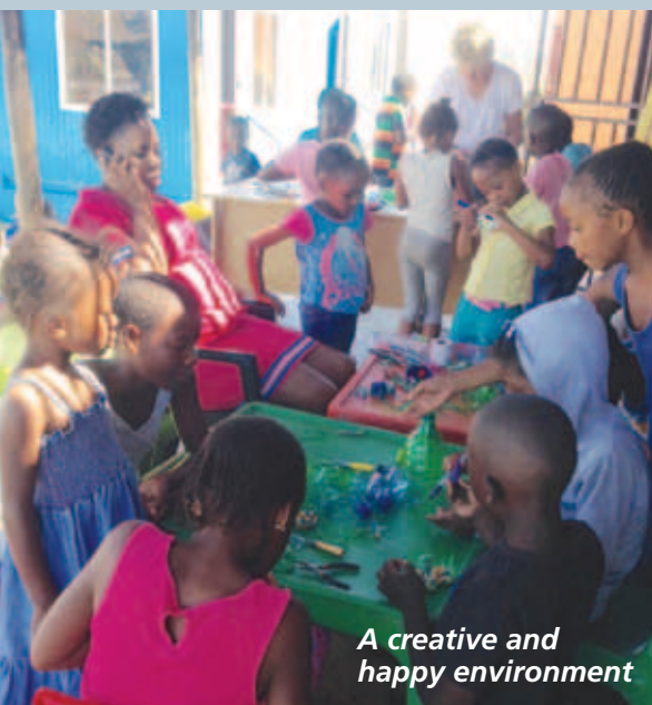
A creative and happy environment