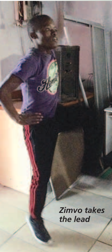
Zimvo takes the lead