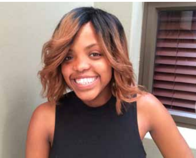
All smiles in spite of it all