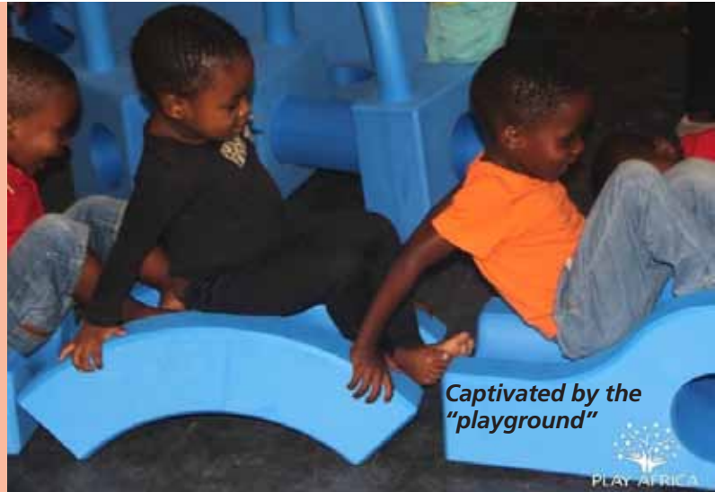
Captivated by the "playground"