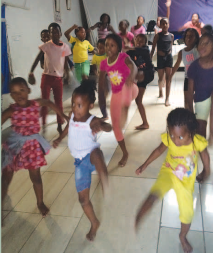
Energised at the end of the day

police to make a plan, but until such time as the rooms are vacated, the dancers are happily practising their skills in a safer space. The class was taken by Zimvo, Jack's right hand and a dancer of note. There were 24 children there, from a tiny 4-year-old upwards, all full of enthusiasm, culminating in the famous Mango Groove's Special Star .