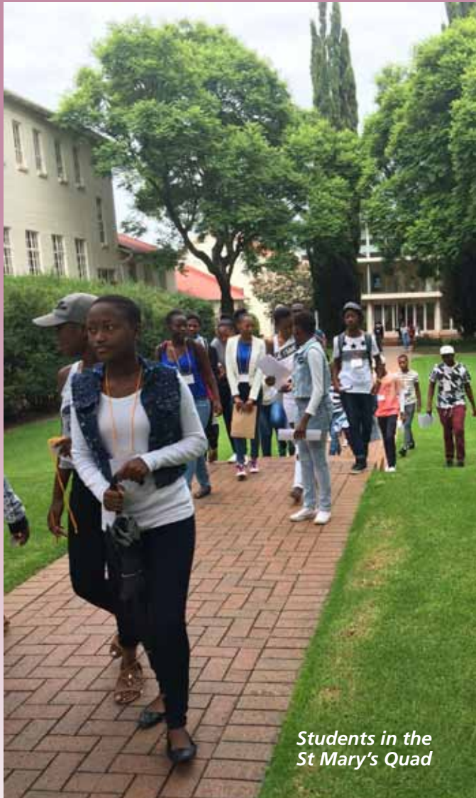
Students in the St Mary's Quad