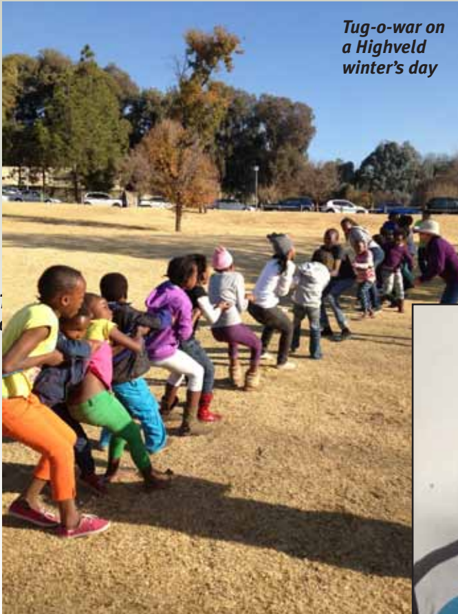
Tug-o-war on a Highveld winter's day