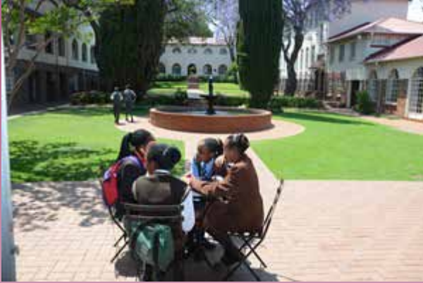
Lunchtime in the St Mary's beautiful grounds

St Mary's School, Johannesburg, has for the last 25 years recruited children from Alex schools as part of an Outreach Programme. Each year 250 children from Grades 9 to 12 spend Saturday morning at the school. Teachers and volunteers give up their time to coach the children in all subjects, but particularly Maths, Science and Accountancy. When the school term ends, they continue with holiday programmes and motivational talks by past students.