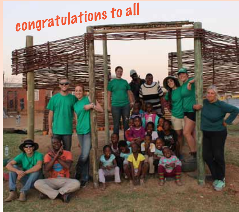
A well-earned break for the Cal Poly students

It has been recently announced that these students won the National Students Award of Excellence for this project. This is the highest award offered to students of Landscape Architecture in the USA. Kidlinks has been mentioned as a project partner and this will bring national awareness to their work. They were featured in Landscape Architecture magazine, and in addition, one of the pieces will be constructed and exhibited at the Museum of Modern Art in New York. This is a huge honour for the students – congratulations to all.