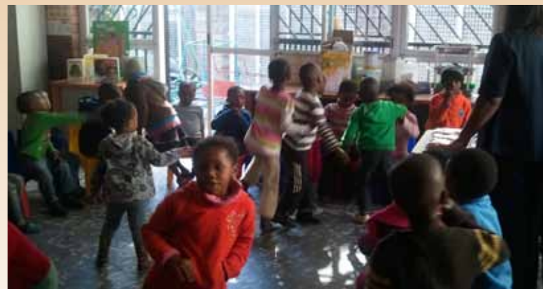
One of the happy classrooms on Mandela Day

Mandela Day this year was hectic at Leratong and visitors came from all around Joburg – private organisations, business and government institutions, and SITA (the State Information Technology Agency). Huge bags were delivered of groceries, clothing, etc. The children were treated to delicious food, while the directors and CEOs cleaned, painted and did all kinds of dirty work for their 67 minutes... and more. Tata's legacy lives on and is celebrated by all South Africans. Thank you, Madiba.