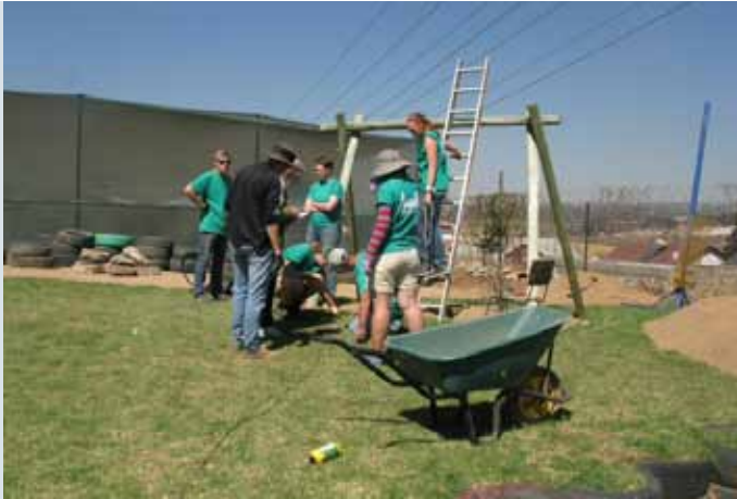
Mending swings and making little lives happier