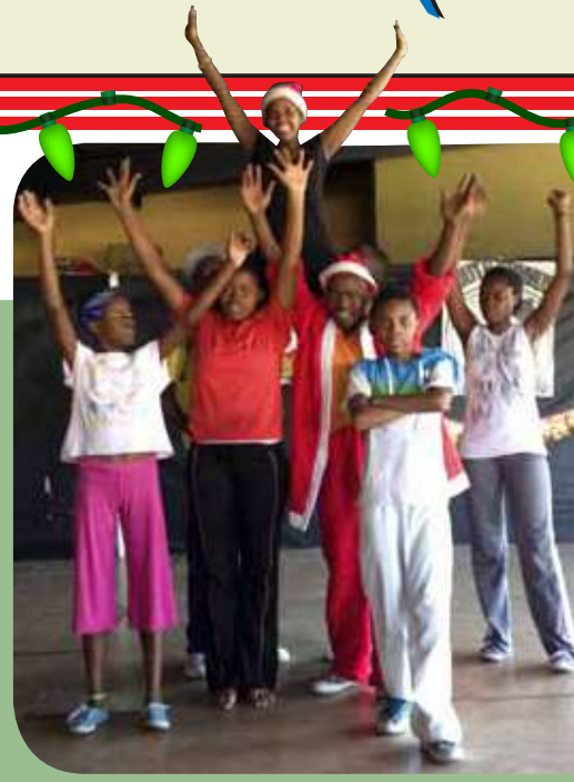
The brilliant township jive finale

The boxes were handed out, the countdown began... and then there was shouting and screaming as they unwrapped the contents. What an amazing day for the children... and also for the onlookers!