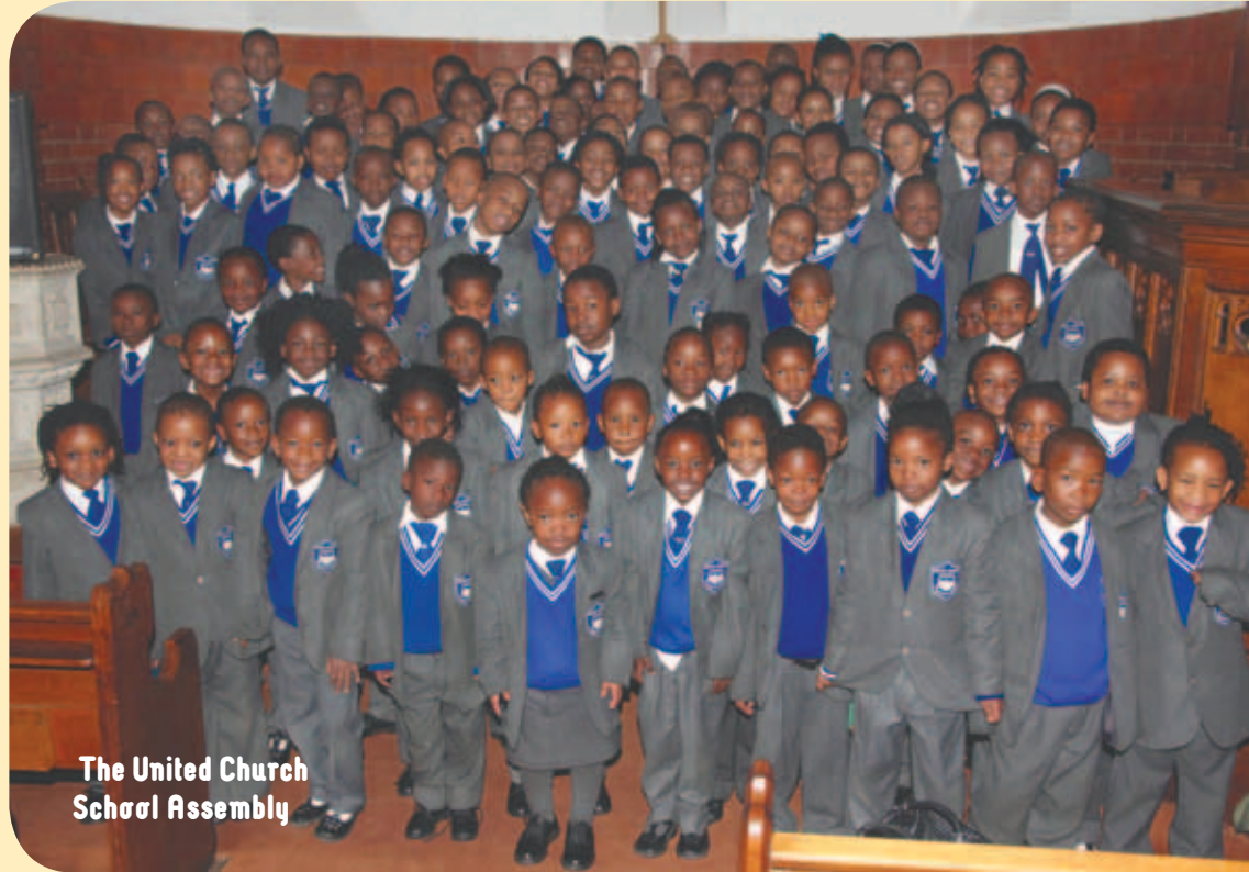
The United Church School Assembly