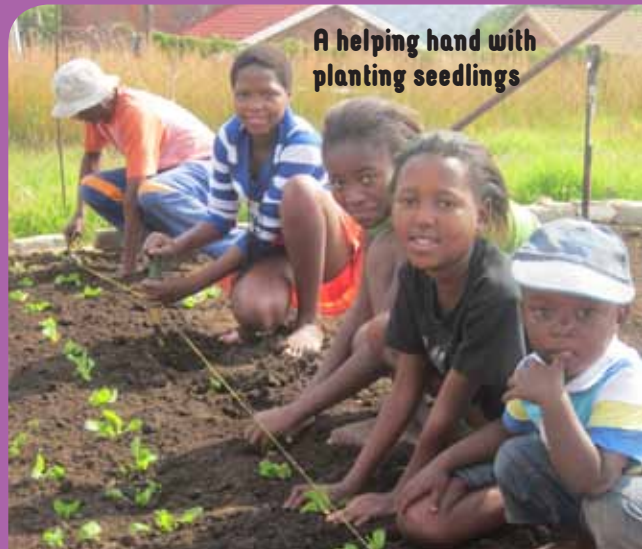
A helping hand with planting seedlings

The Centre was once more a-buzz with supporters wanting to be involved in their "67 minutes community time" in honour of the 67 years Madiba gave to community work. To be involved in any of these initiatives is a very moving, ubuntu experience. Some of the activities were: playground building; painting; preparing/cooking lunch; talks and eTV filming. As always I came away feeling happy-hearted and excited about the action and improvements at Ratang Bana.