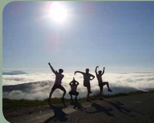
The cyclists on top of the world!

The CalPoly students have arrived in SA and will begin work soon on the Ratang Bana playground. Watch this space in the next newsletter!