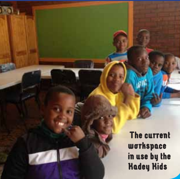
The current workspace in use by the Kadey Kids