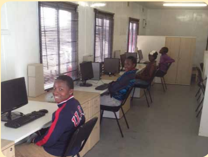
Making a difference to children's education

We are happy to say that the Learning Centre at Ratang Bana is up and running – thanks to the funding from Gumboots UK. The centre now has electricity, 4 computers, desks and chairs, as well as a safe and secure environment in which to study. We are awaiting the installation of wireless internet. The library shelves and books will be moving into the centre and a quiet reading space will be created. We are looking for mentors who will be able to assist the children with homework and projects.