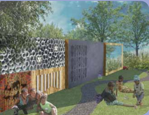
An example of what the students are going to create for the new playground

It has been a summer (in the US) of preparation for the August student trip to South Africa to build a playground at Ratang Bana. The students of CalPoly, San Luis Obispo have developed a wonderful long-range plan that includes graphic