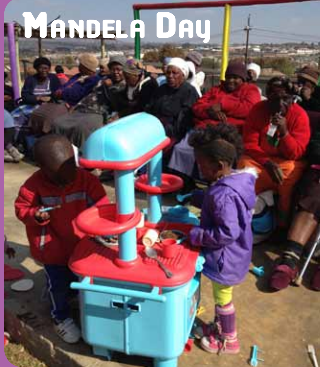
The gogos and children waiting for the celebrations to begin

The Centre was once more a-buzz with supporters wanting to be involved in their "67 minutes community time" in honour of the 67 years Madiba gave to community work. To be involved in any of these initiatives is a very moving, ubuntu experience. Some of the activities were: playground building; painting; preparing/cooking lunch; talks and eTV filming. As always I came away feeling happy-hearted and excited about the action and improvements at Ratang Bana.