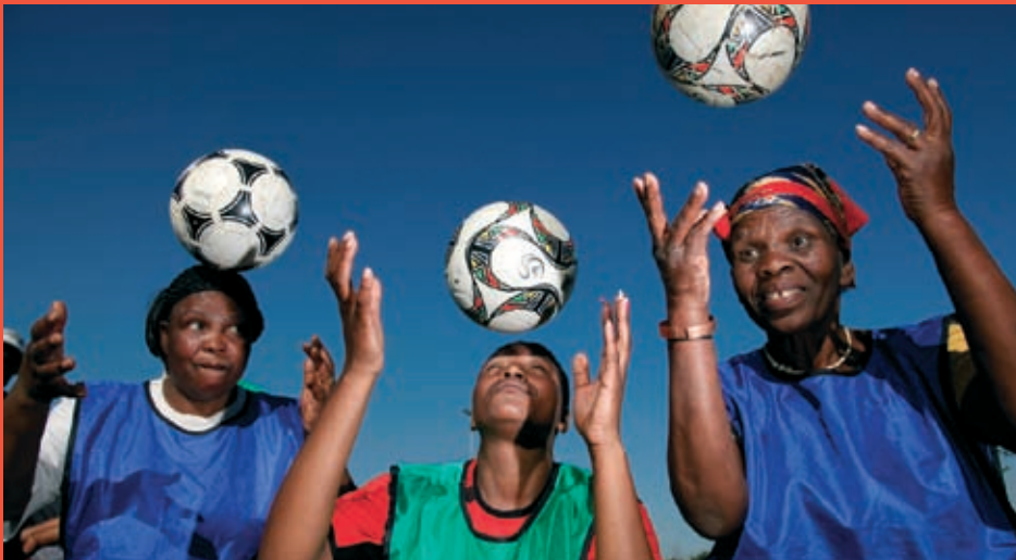
Laduuuma! The gogos in action

The gogos are in dire need of boots, tights and refreshments – can anyone help?