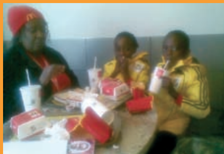
Ke nako – 2 of the orphans enjoy burgers in preparation for escorting the teams

It was a day that 8 orphans from the Ratang Bana "family" will never forget – they were taken to the Ellis Park Stadium, given soccer kit and burgers, before 2 of them were chosen to escort the USA and Slovenia teams onto the pitch. They went out proudly holding the hands of their heroes while the other 6 kids cheered from the stand.