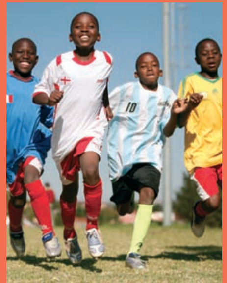
The Red Roses 2010 players in team colours

For just one day the boys from Ingrid's Red Roses Football Club were the heroes of the World Cup – they organised their own championship at their club and each chose to represent one of the 32 countries. Soccer shirts for each country were supplied – and the fun began as they battled it out for the trophy.