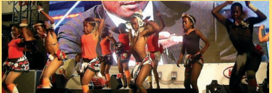
Traditional dancing at Innesfree Fan Park

"There are no words to describe the feeling of performing at the Fifa fan parks. We were very happy to do what we love (which is dance) during a superb event of the world. We even had the opportunity to meet international artists and football players such as Shakira and Zidane. Many dancers wanted this opportunity and they did not get it, plus we made a name for ourselves because many people who did not know that we existed now know us!"