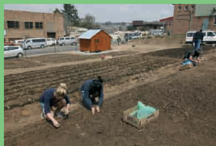
And after: baby seedlings a-plenty