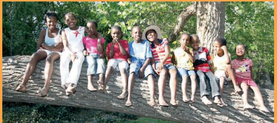
Laughter on a large log

The new adventure playground at Delta is a wonderful place for a picnic – the photos say it all.