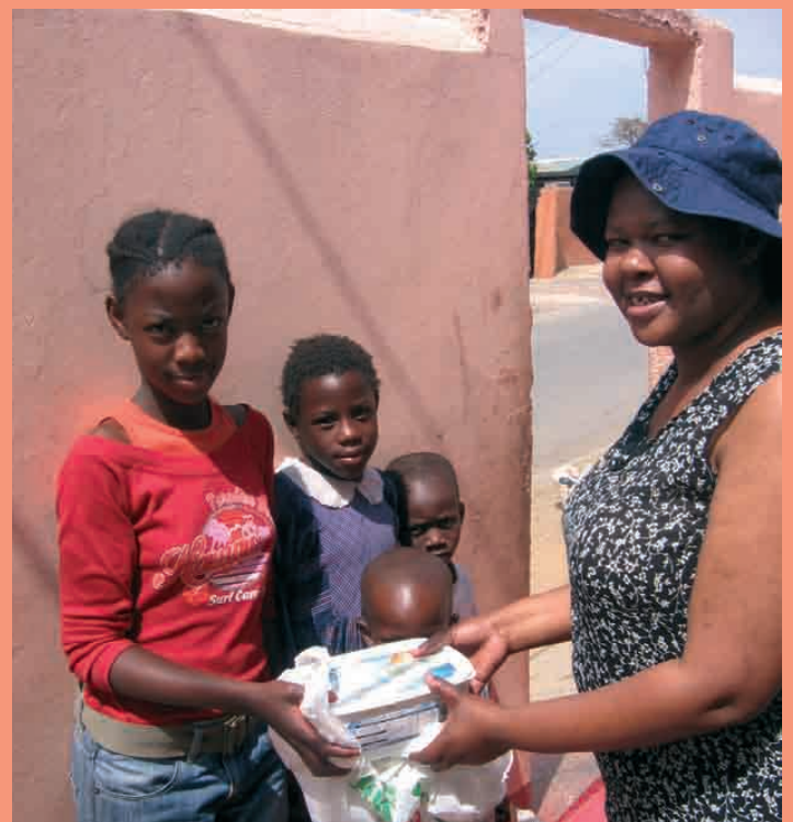
And the left-overs are given to her orphan friends