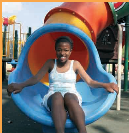
Tshulofelo – the oldest 'sister' had a wonderful day