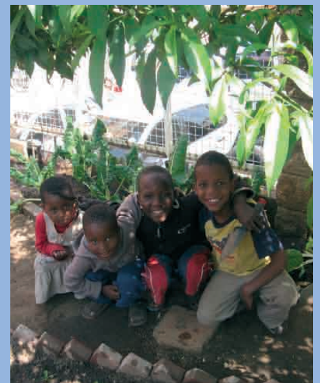
The Kodyx under the peach tree in the garden